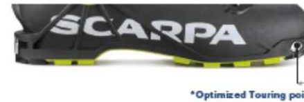
*Optimized Touring point

In order to maximize all efficiencies when moving uphill, some models with TLT fittings have moved the tech toe fittings further under the foot. This effectively makes for a more natural stride that offers significant energy savings - especially important on big days!